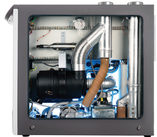
EnerTwin 3kW micro-CHP system

The recuperator is an advanced heat exchanger recovering exhaust heat into the gas turbine working cycle, saving almost 50% of fuel compared to a system without a recuperator and providing a substantial increase in efficiency.